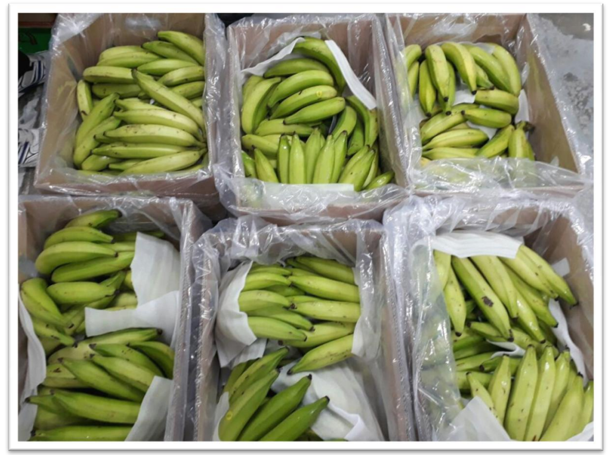
Nendran Banana sailed from the Cochin Port, India and received after 12 days at the Dubai Port