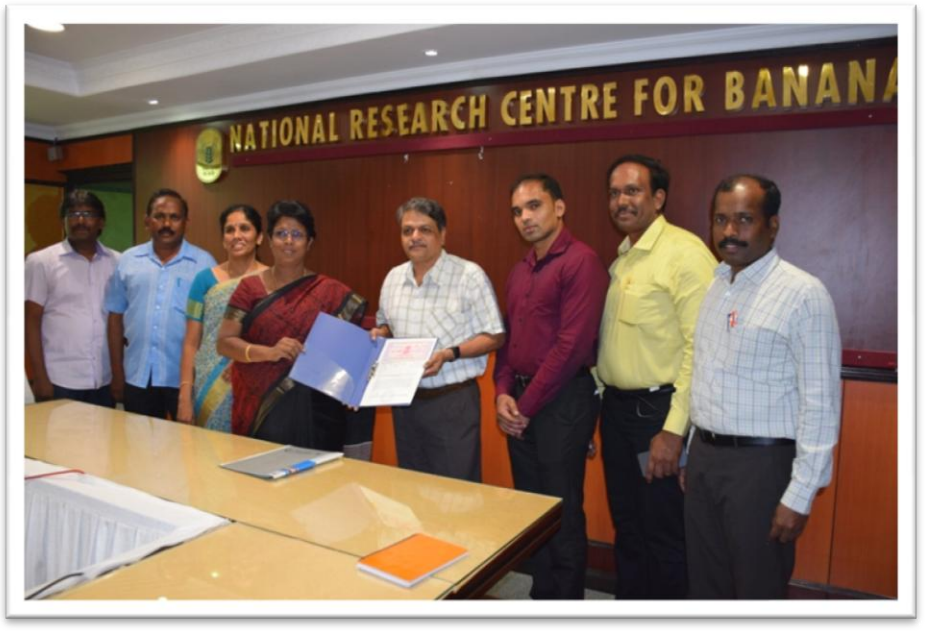
MoU signed with the APEDA for the Development of Sea Shipment Protocol for Nendran

The success of this project encouraged APEDA to collaborate with NRCB on other projects and to transfer the NRCB developed technologies to the exporters which could pave the way for cost effective exports of Indian bananas to other countries.